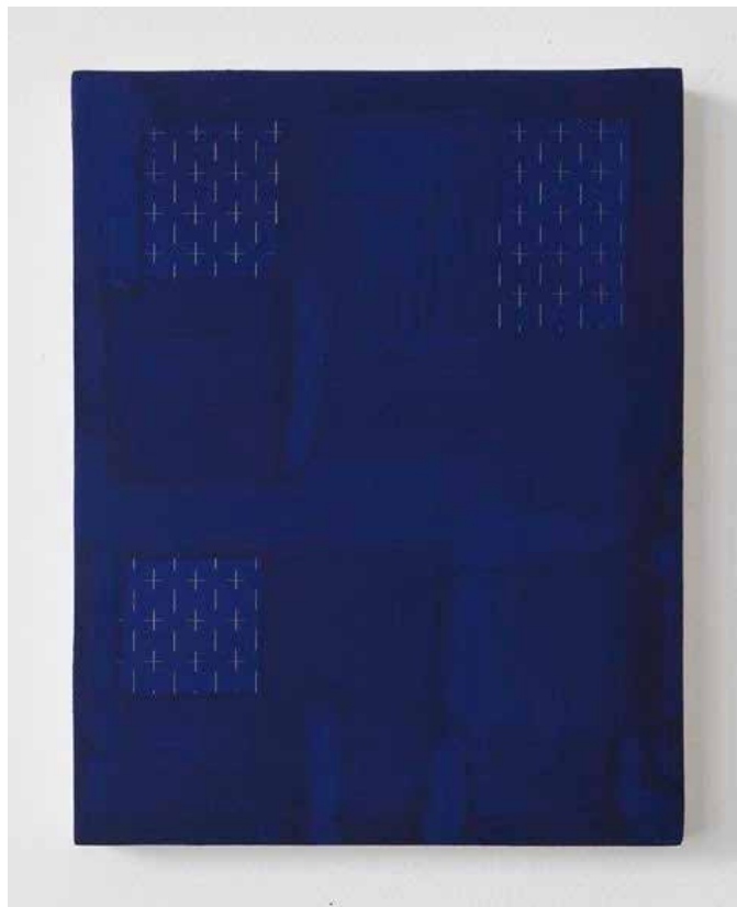
Alison Hall, Brooklyn Nocturne XIV, My Three Eyes , 2015, 9 1/2 x 7 1/2 in., oil, graphite, and venetian plaster on panel