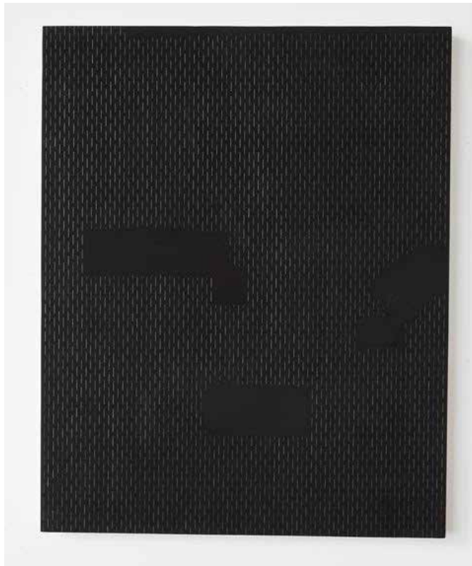
Alison Hall, Relics , 2015, 27 1/2 x 22 in., oil, graphite, and venetian plaster on panel